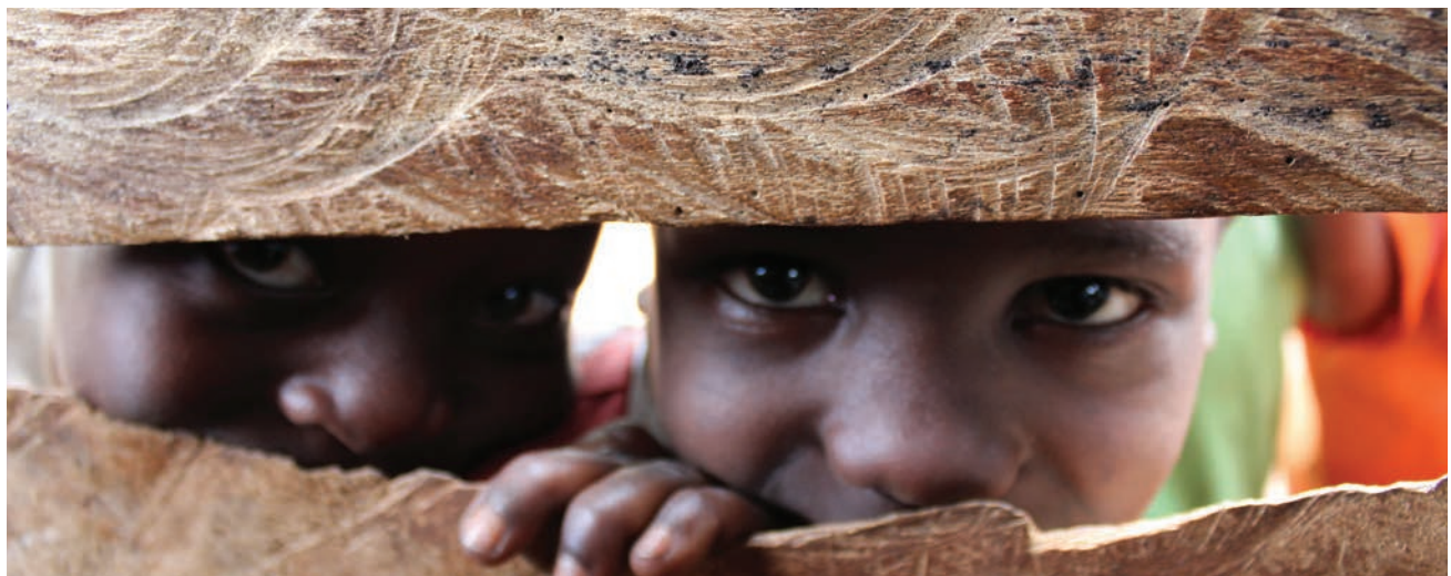
St. Francis Healthcare Services

The programmes run by St. Francis have been restoring hope and dignity to these families, empowering grandmothers, and helping to ensure brighter futures for their grandchildren.