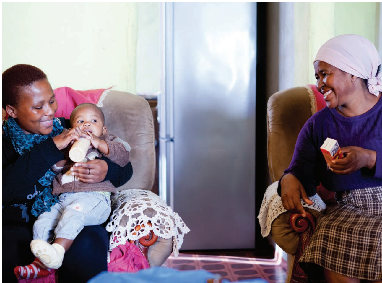
Treatment Action Campaign | Photographer: Alexis MacDonald/SLF