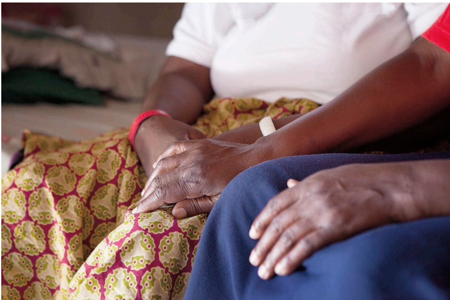
Catholic AIDS Action (CAA), Namibia

Even though a situation may seem hopeless, these grandmothers have developed the inner strength to press on. They are much more able to deal with tough situations as compared with before. For instance, when drastic weather changes started negatively affecting their crop produce, the grandmothers were able to rely on group support, group savings to purchase some food stuffs, and their revolving loan scheme to get capital for farm inputs. In addition, because of the trainings on good postharvest handling, most of them were able to preserve their seeds for replanting, especially vegetables and beans. ARUWE, Uganda