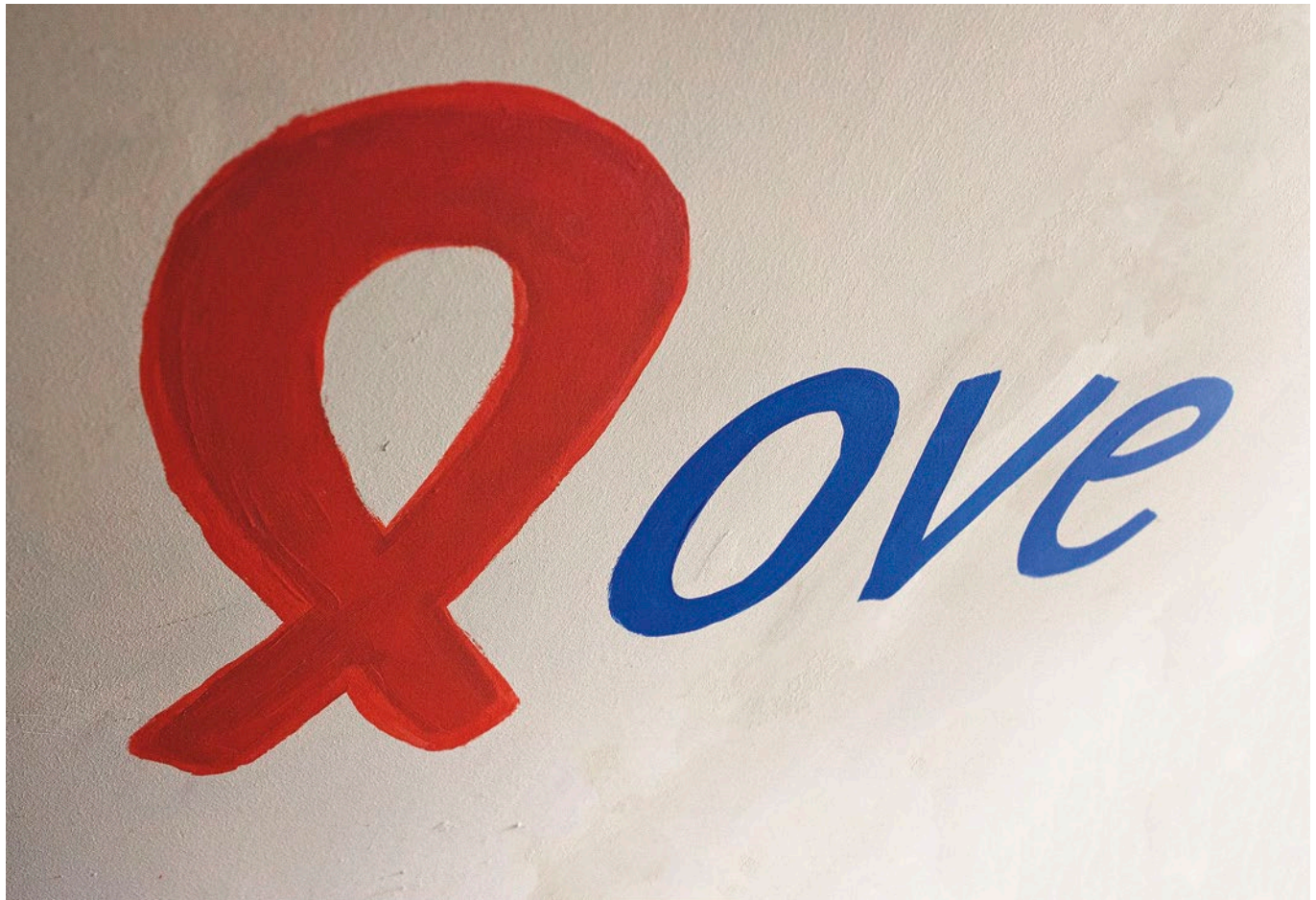
Blue Roof Clinic—Keep A Child Alive (KCA), South Africa

We offer a safe space at our organization where our clients can come and freely associate. Joining with others gives them a feeling of belonging in the face of double stigma, first for being LGBT and then for being HIV-positive. In addition, we make a counsellor available who helps our members living with or affected by HIV to cope, and builds their self-esteem to be able to live positively. We also arrange for referrals and linkages, especially for the clients who live in rural areas, so they can access treatment.