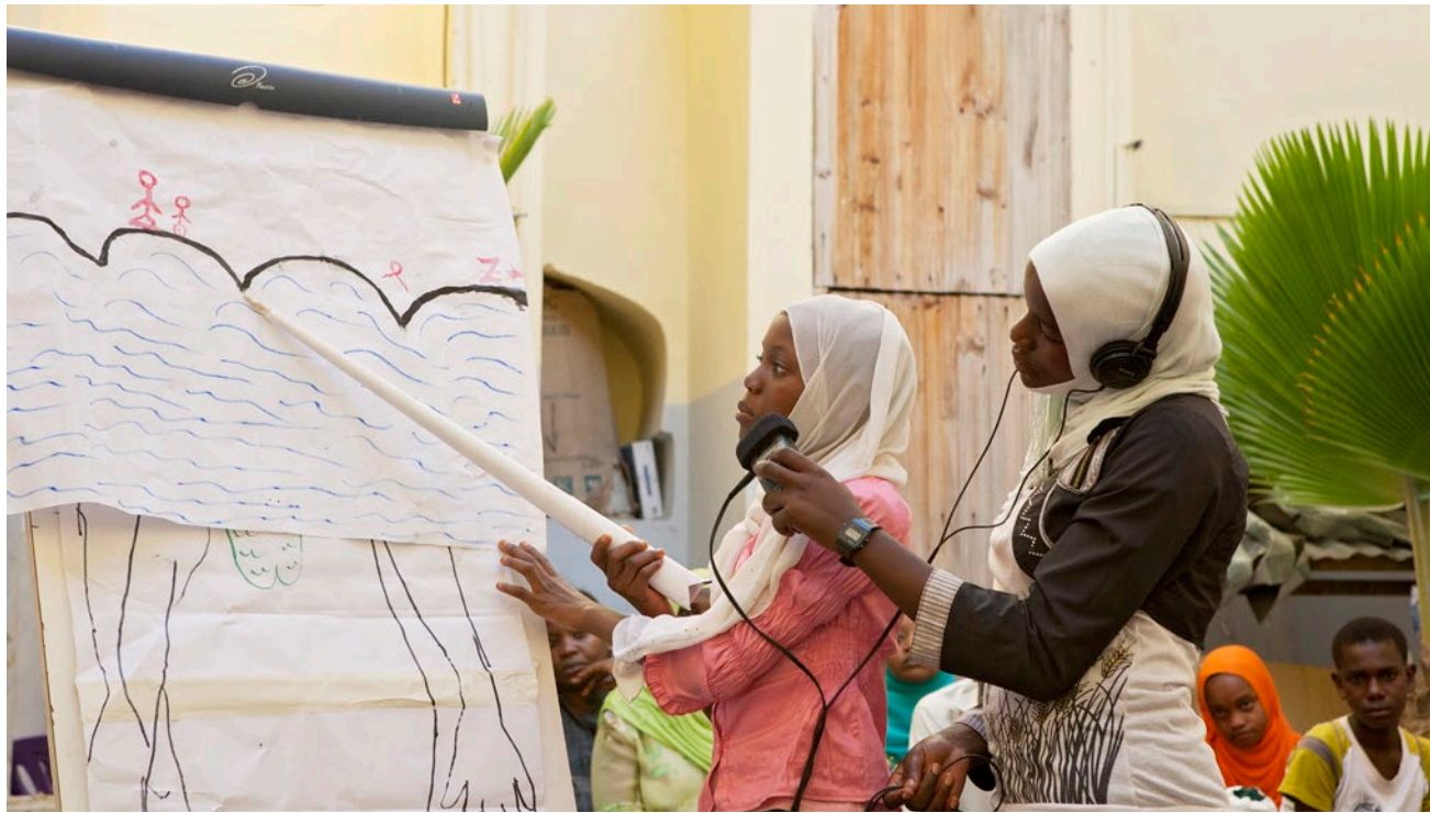
Zanzibar Association of People Living with HIV/AIDS (ZAPHA+), Tanzania

Social norms that condone the sexual coercion of girls and young women, and trivialize assault and rape, pose another major challenge. Mutual support groups for adolescents are the perfect place to address this issue, as youth are just in the process of forming their understanding of their own sexuality. The adolescents' mutual support groups devote a lot of discussion time to helping both boys and girls envision what good, healthy relationships can look like. In some cases our community-based partners are also setting up dedicated support groups to tackle the problem.