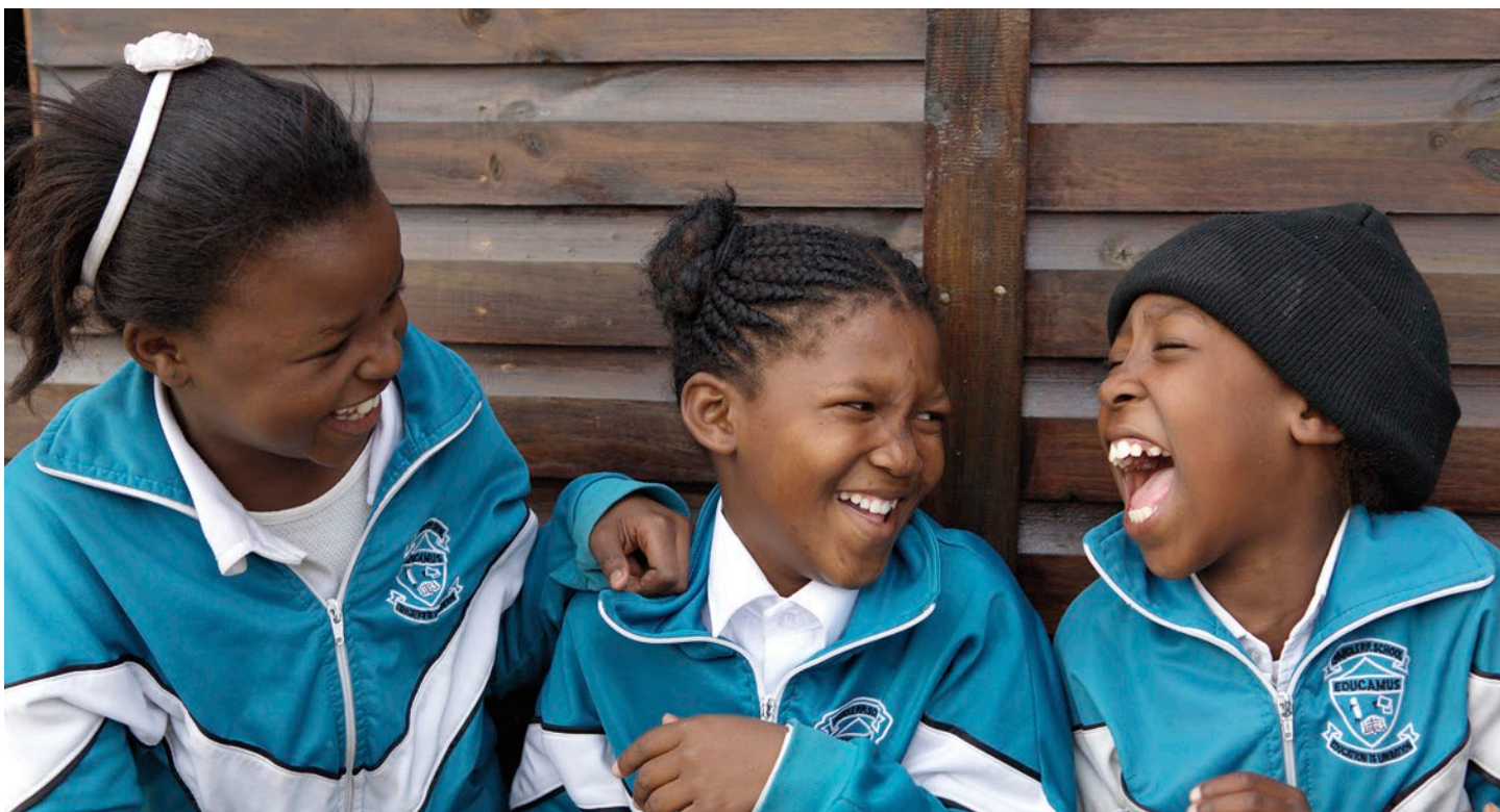
Grandmothers Against Poverty and AIDS (GAPA), South Africa

As we know from past experience, many of the children were never properly informed about what happened to their loved ones, or were given pieces of misinformation which they struggle to make sense of. They needed to be given the space to understand and come to terms with the finality of death—a process which culminated in the camp when the children were supported through very painful experiences of grief and loss. For many it was also a safe space in which they could talk about their feelings, as well as about their current living conditions and care arrangements. The sense of loss extends well beyond the grief for the deceased loved one, as the children explained: