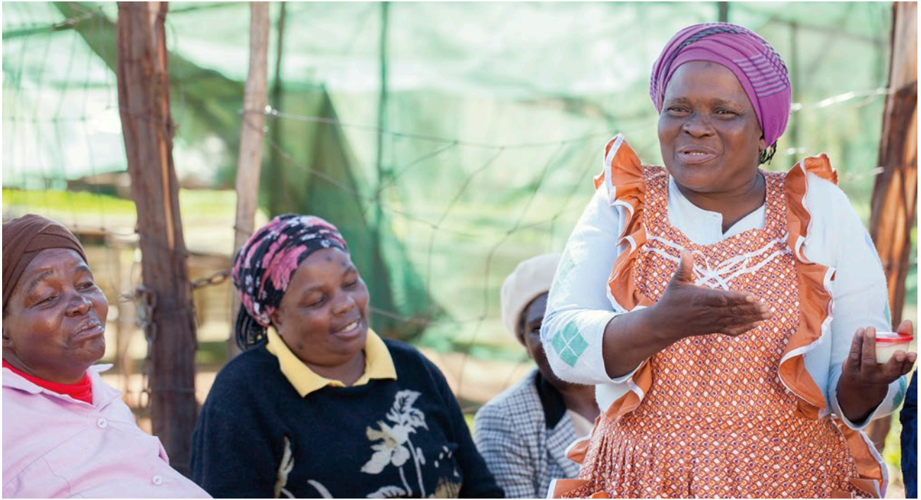
Swaziland Positive Living (SWAPOL), Swaziland

into another person's mind or heart, it is possible to observe inner transformations through behavioural change—by looking at what the CBOs' beneficiaries are now saying and doing.