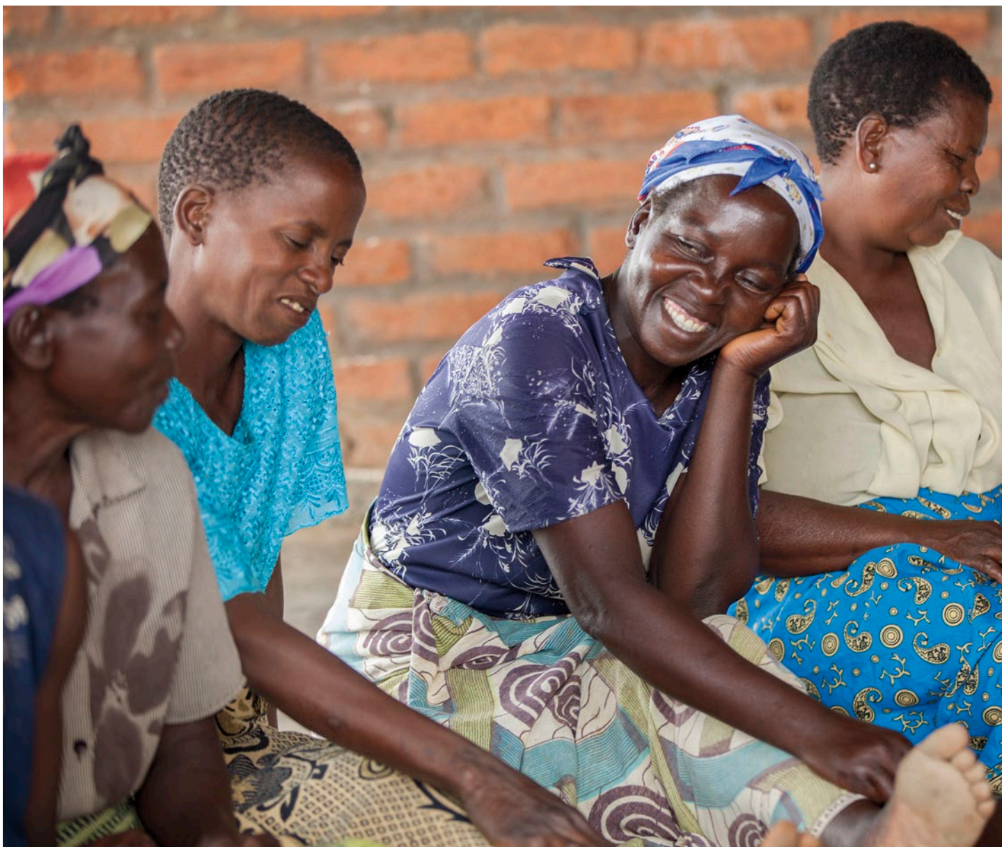
Women's Legal Resources Centre (WOLREC), Malawi

still continue in whatever state it will take. If a child can rethink positively in that manner, then she or he will not be so badly affected, and can plan in a strategic direction with higher hopes for the future. ACODEV, Uganda