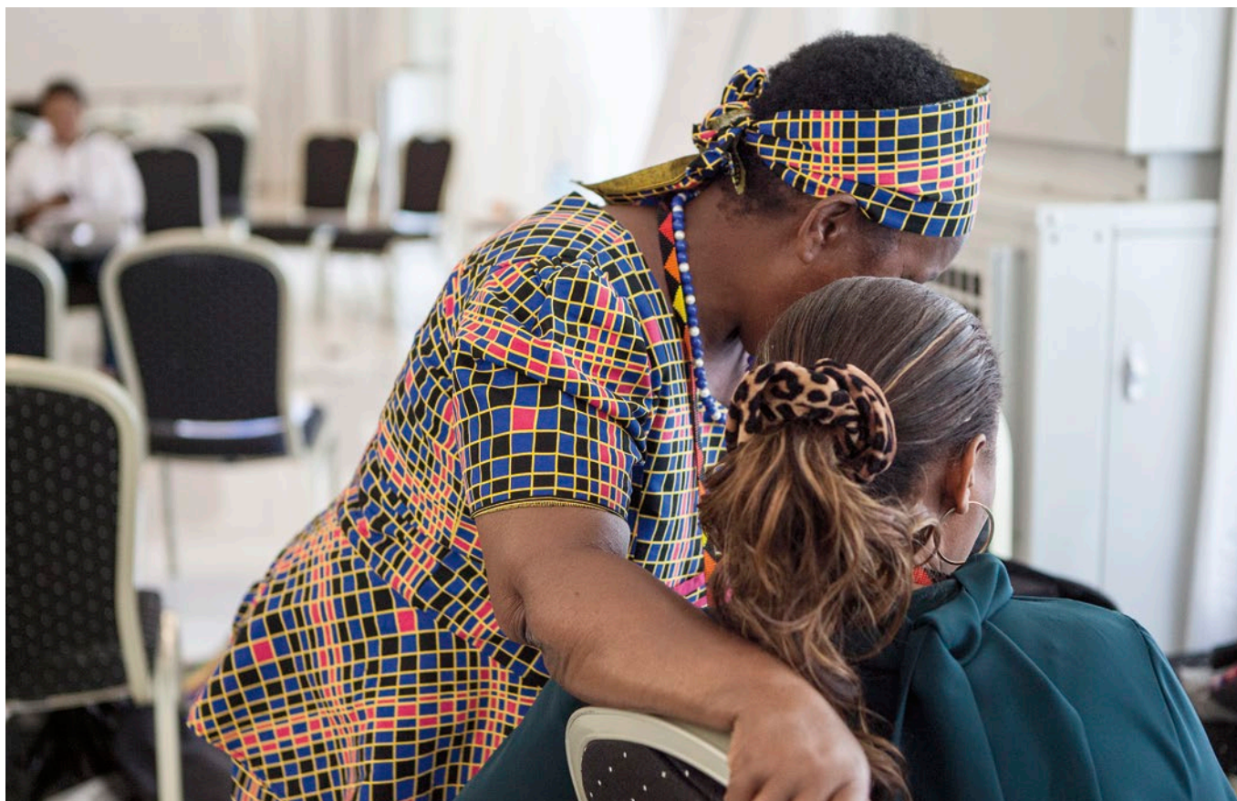
Pastoral Activities and Services for People with AIDS Dar es Salaam Archdiocese (PASADA), Tanzania