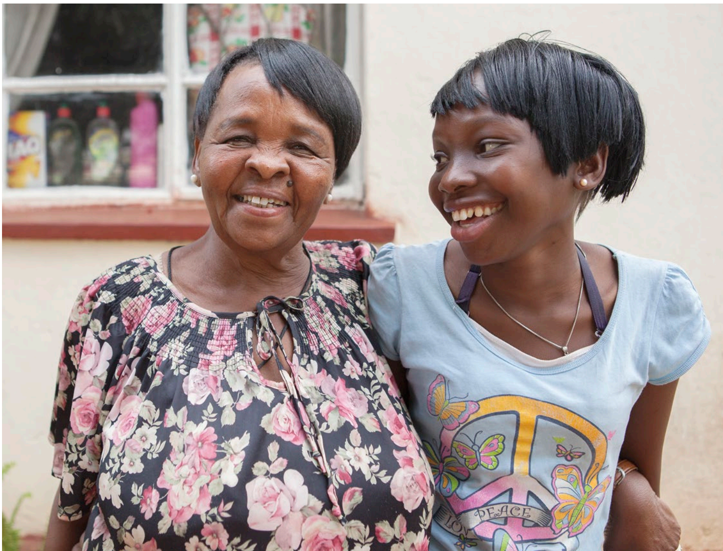
Chiedza Child Care Centre (CHIEDZA), Zimbabwe