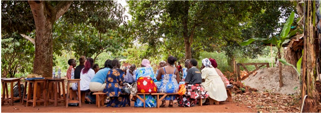
Phoebe Education Fund for AIDS Orphans & Vulnerable Children (PEFO), Uganda

on their own. These activities include advocating for HIV testing, encouraging people to adhere to their ARV treatment, and educating people to stop stigma and discrimination against those who are infected with HIV.”