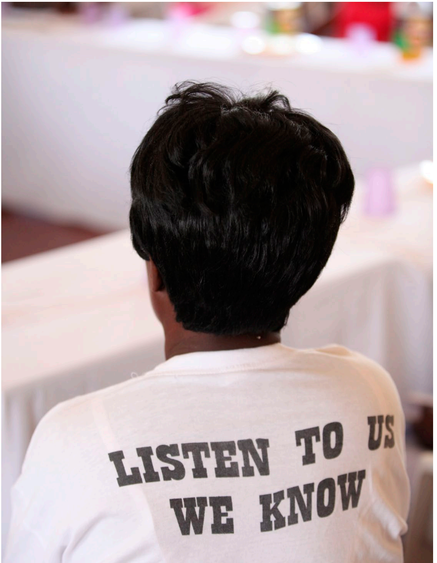
Midlands AIDS Service Organization (MASO), Zimbabwe