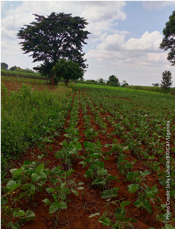
Drought-tolerant crops are part of BIDCAF's climate-smart agriculture program.