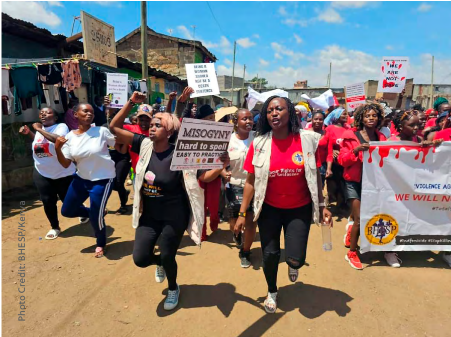
BHESP has grown into a leading organization advocating for women's rights and safety.