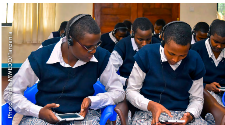
MWEDO plans to expand digital learning for students at its secondary school for girls.

Since 2005, MWEDO has helped over 1,500 Maasai girls in Tanzania continue their secondary education, overcoming traditional barriers like early marriage. MWEDO provides tuition, accommodation, meals, and health care to allow each girl to focus on her studies.