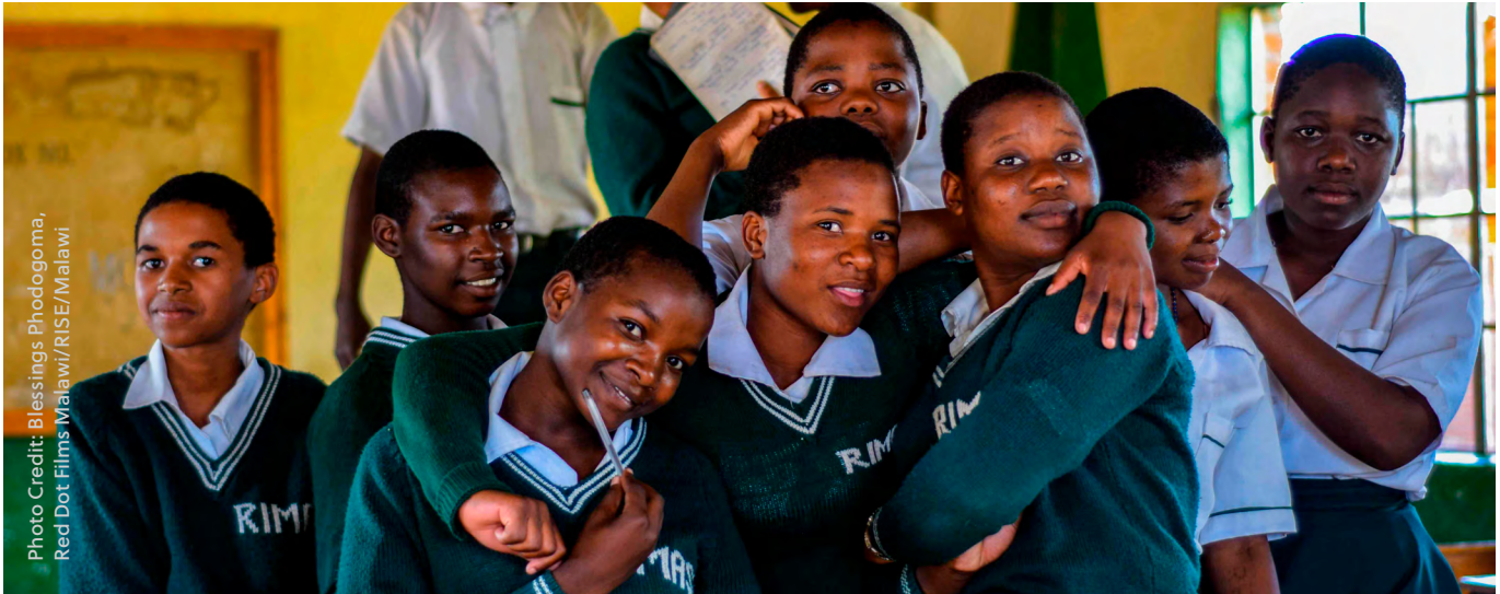
Students at RISE Malawi.

In 2025, the Stephen Lewis Foundation's partners will continue providing essential services and leadership within their communities. The systems of support these organizations have established give families the stability they need to build toward healthy and self-determined futures. As illustrated in this report, many factors threaten this stability, including economic shocks, climate change and social injustice. Through challenges, crises and upheaval, families look to community-led organizations for additional support on the path forward.