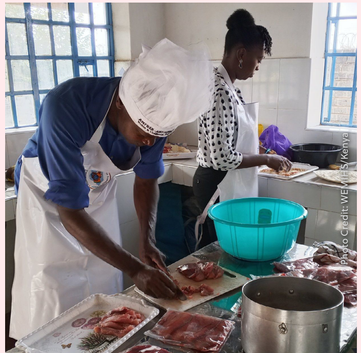
WEMIHS provides training in fish farming, harvesting and preparation for consumption and sale.

For communities affected by HIV, food and income security are an important part of addressing the inequities that continue to drive the epidemic. For people living with HIV, this translates into more power over health and well-being for themselves and their families. Adherence to treatment, which includes adequate nutrition, is an important part of HIV prevention and care. SLF partners like WEMIHS are improving immediate and long-term health outcomes for their communities.